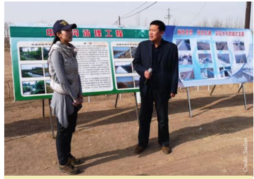
EU-CHINA RIVER BASIN MANAGEMENT PROGRAMME

Separated by language, culture and thousands of kilometres, the Danube and Yellow Rivers hardly seem to have much in common. But together these two river basins are learning from their differences and exploring their similarities to take on the challenge of integrated river basin management.