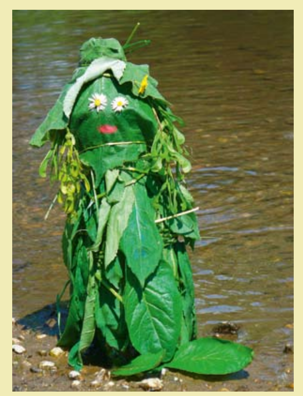
CZ: Art Master Water Sprite.

Overseen by new coordinators, Global Water Partnership, 14,000 drawings and nearly 1000 sculptures were made. The huge response was the result in large part of Austria's successful Environment Ministry and Coca-Cola 'Trinkpass' action. Young Moravians went Art Master crazy with 720 entrants from a record 54 Czech schools. Creativity bloomed in Slovenia, where three national contests challenged children to become art masters, water detectives and photo journalists. In Ukraine, the Prut, Tisza and Delta regions held a joint competition for the first time. National winners from each country now go on to the international final in Budapest to find out who will be crowned 'International Danube Art Master for 2011'.