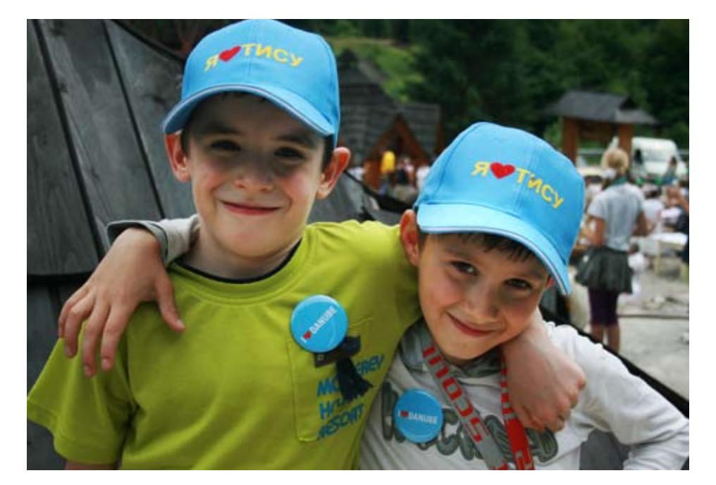
In every Danube Basin country, Danube Day festivities have their own special flavour, ranging from educational lectures on environmental topics to fun events that show how important rivers and their ecosystems are to our lives.

"Shared waters - joint responsibilities" is a motto often used by the ICPDR to highlight that rivers connect people and commit them to joint actions to improve water quality. This happens on various levels - from the international roof-level to the local grass-root environmental activity. Danube Day on the 29th of June celebrates all of these efforts and invites tens of thousands of people throughout this unique river basin to join in the world's biggest river festival. This year, it will do so in the light of a very special group of fish: "Get active for the sturgeons!" will be the motto, which will highlight habitat protection, fish migration and poaching which has driven Danube sturgeons to the brink of extinction.