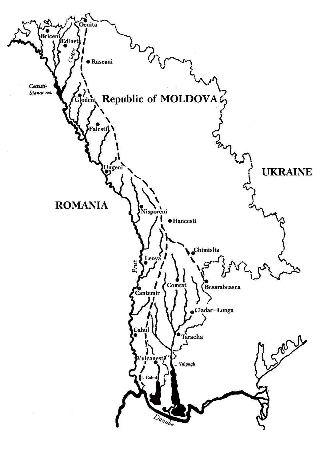
Figure 3.1. Map of the administrative districts of the Moldavian part of the Danube River basin