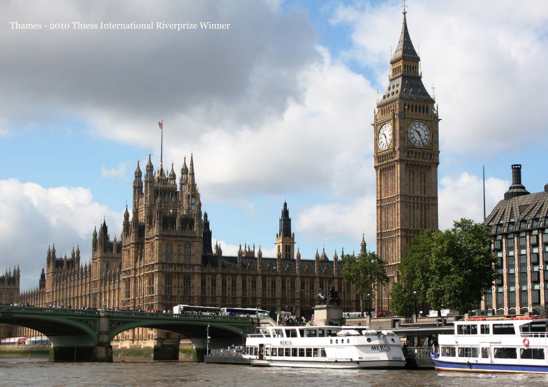
Thames - 2010 Thies International Riverprize Winner