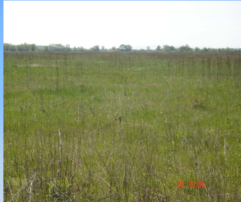
Potential area for wetland