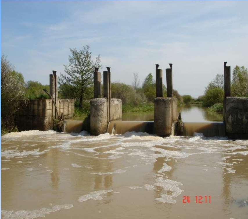
Cibavka „Flood Gate“